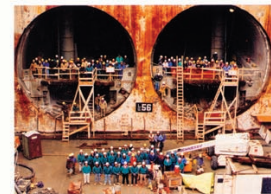
BIRD ISLAND FLATS TUNNEL Boston, Massachusetts In constructing this 4,000-foot cut-and-cover tunnel at Boston's busy Logan Airport, more than 310,000 of the total 500,000 cubic yards of concrete were poured in just under nine months. In addition, the 90-foot-deep tunnel called for the excavation of nearly 1.4 million cubic yards of earth — 800,000 of which were transported via barge to nearby Spectacle Island.

Our ability to deliver high-quality services — efficiently and cost-effectively — is evident in the hundreds of projects we have completed in these and many other major areas of construction.