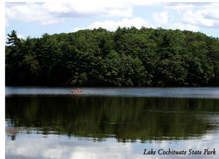
Lake Cochituate State Park