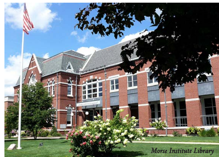
Morse Institute Library

Encompassing a total area of 16.1 square miles, Natick offers a sought after blend of urban and rural qualities. Within the town itself there are vibrant shopping and dining venues, entertainment and recreational options including a thriving Center for the Arts, a movie multiplex, Lake Cochituate, the Cochituate Rail Trail – a 4-mile trail network for pedestrians and bicyclists, the newly expanded Natick Collection mall and much more.